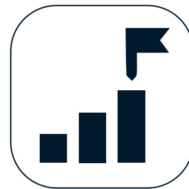
Challenge Based Training